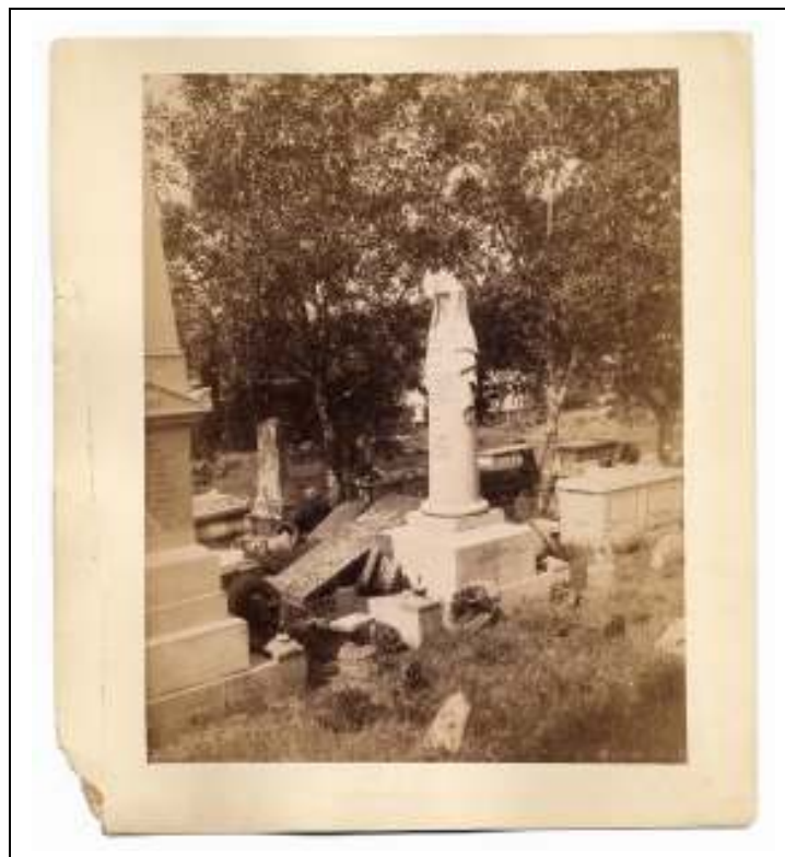
Vandalism of Corfu Jewish Cemetery 1891

Kehila Kedosha Janina e-newsletter: number 6: July 2008