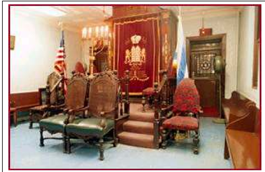
Aron Kodesh before restoration