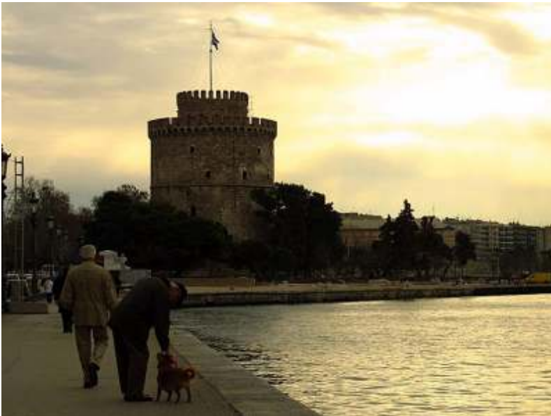
Thessaloniki: White Tower

This year we will be visiting Salonika, Ioannina, Volos [with day trips to Meteora, Pelion and Skiathos ] plus optional extensions to Santorini, Mykonos, Rhodes or Israel . Book a 3 or 4-day cruise. We will do it all for you. Come with us to see the beauty of Greece and a Jewish Greece you will see with no one else. Our past participants describe our tours as a life changing experience-join us-see why! For a complete itinerary plus prices (basic itinerary [11 days] is presently priced at $3945 per person double occupancy-with the fluctuations in the euro, we cannot guarantee these prices past April 1 st ), contact us at kehila_kedosha_janina@netzero.net .