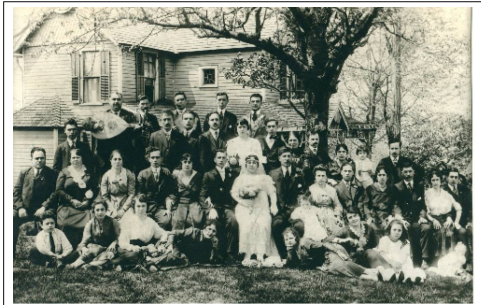
This picture was taken in New Jersey in 1915: can anyone identify anyone?