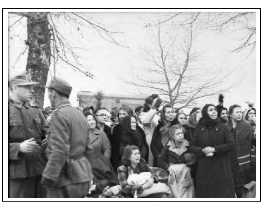
Photographs of the deportation of the Jews of Ioannina taken on March 25<sup>th</sup>, 1944