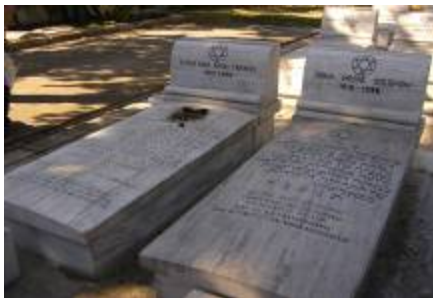
Photo of damaged tombstones.

Central Board of Jewish Communities in Greece