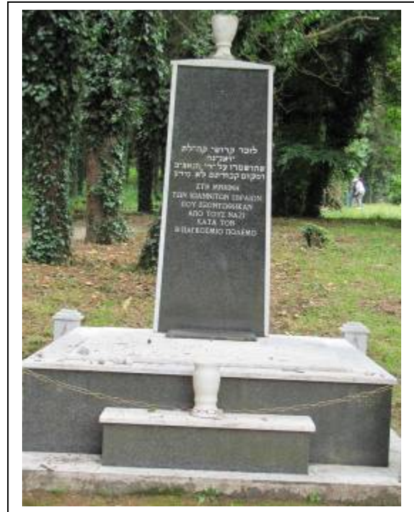
Repaired Holocaust Memorial

Unfortunately, we have a new problem in Ioannina. Moisture had seeped into the Aron Kodesh and damaged 5 Torah scrolls. Experts from Israel have viewed the damage and will be involved