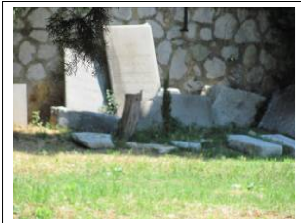
Below-Memorial to Jewish Soldiers who died on the Albanian Front 1940-1941