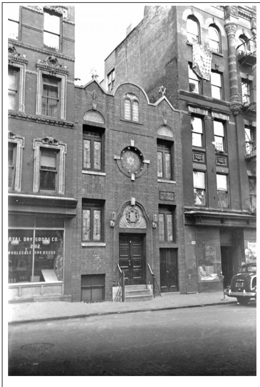
Kehila Kedosha Janina 280 Broome Street 1939

And the world they found here in the United States. For the Genee and Ferman families, this was the Lower East Side of Manhattan.