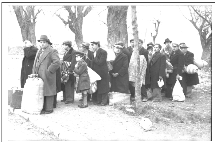
Ioannina Deportation 3/25/1944

March 15, 2009 marks the 66 th anniversary of the first transport of Jews from Salonika to Auschwitz-Birkenau: 19 additional transports followed. March 25 th marks the 65 th anniversary of the roundup of the Jews of Ioannina, Arta, Preveza, Athens, Chalkis, Volos, Trikala, Larissa and Kastoria. Most were murdered at Auschwitz-Birkenau. We, here at Kehila Kedosha Janina, stop and remember.