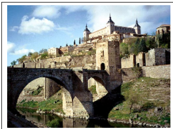
Bridge of Alcántara,