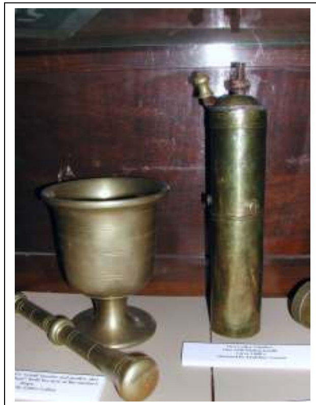
Mortar & Pestle and coffee grinders

Chop and then mash in a mortar the currants and raisins. Mix in the walnuts and whole pine nuts. Add cinnamon and cloves to taste. Moisten well with the wine to make a thick paste. Makes 3 cups.